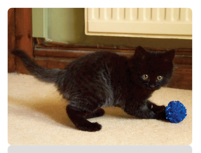
Toys that make a soft noise can be attractive and fun to play with.

• Some toys (known as puzzle feeders) are designed to be filled with cat food and can provide amusement and exercise for inquisitive kittens' bodies and minds. Any food consumed in this way should be considered part of the kitten's daily food allowance to avoid excessive weight gain. Feeding your kitten's daily food ration, little and often, via puzzle feeders will be fun for them, build confidence and teach independence, as well as fulfil the natural problem-solving behaviours and exercise needs involved in frequent hunting and catching of prey (and it is entertaining for us to watch too!).