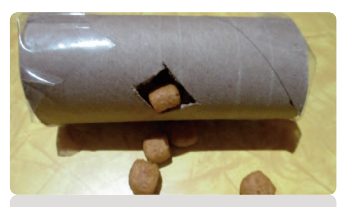
Simple, home-made puzzle feeders can provide lots of entertainment.

• Some toys (known as puzzle feeders) are designed to be filled with cat food and can provide amusement and exercise for inquisitive kittens' bodies and minds. Any food consumed in this way should be considered part of the kitten's daily food allowance to avoid excessive weight gain. Feeding your kitten's daily food ration, little and often, via puzzle feeders will be fun for them, build confidence and teach independence, as well as fulfil the natural problem-solving behaviours and exercise needs involved in frequent hunting and catching of prey (and it is entertaining for us to watch too!).