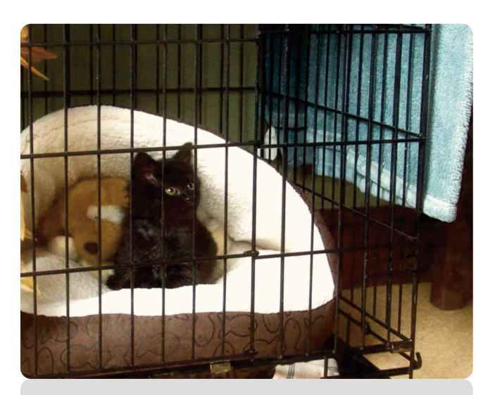
An example of a safe place for the kitten to sleep in overnight.