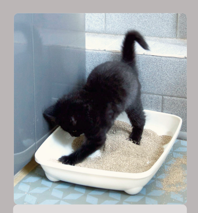
An example of a low sided litter tray suitable for kittens.

For more in-depth information about litters and trays go to: icatcare.org/advice/litter-trays