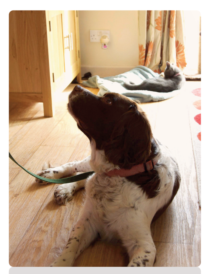
Have the dog on a loose lead for the first few meetings to prevent any chasing or lungeing at the kitten.