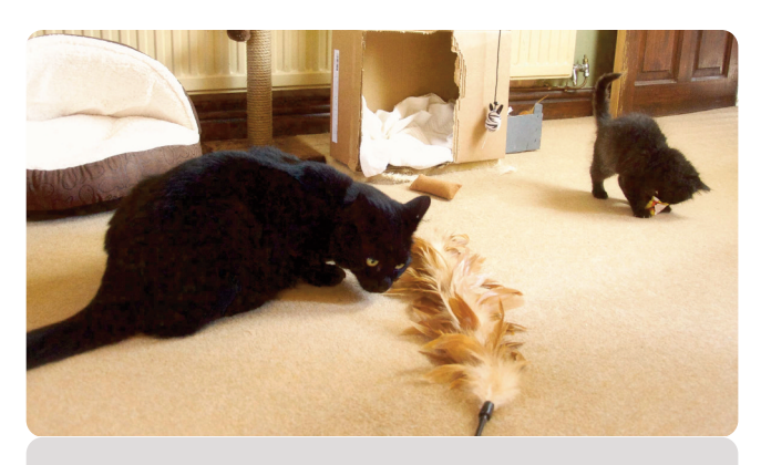
Have a wand toy ready to distract if required during initial meetings.