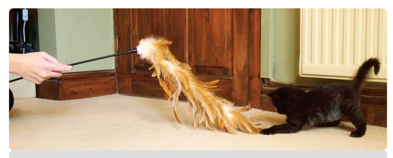
Wand toys on the end of a stick or a stick and piece of string are a great way to play interactively with your kitten and keep it away from hands and feet.

• Wand toys on the end of a stick or a stick that has a feather or small item on the end, or at the end of a string or wire, are a good choice, are easy to keep moving and tend to maintain a kitten's attention. Such toys are interactive, requiring you to move the wand about and they are a fun way to engage with your kitten. Due to their length, wand toys mean that kittens play safely at a distance from you, and they are, therefore, a great way of preventing kittens from swiping or biting at hands.