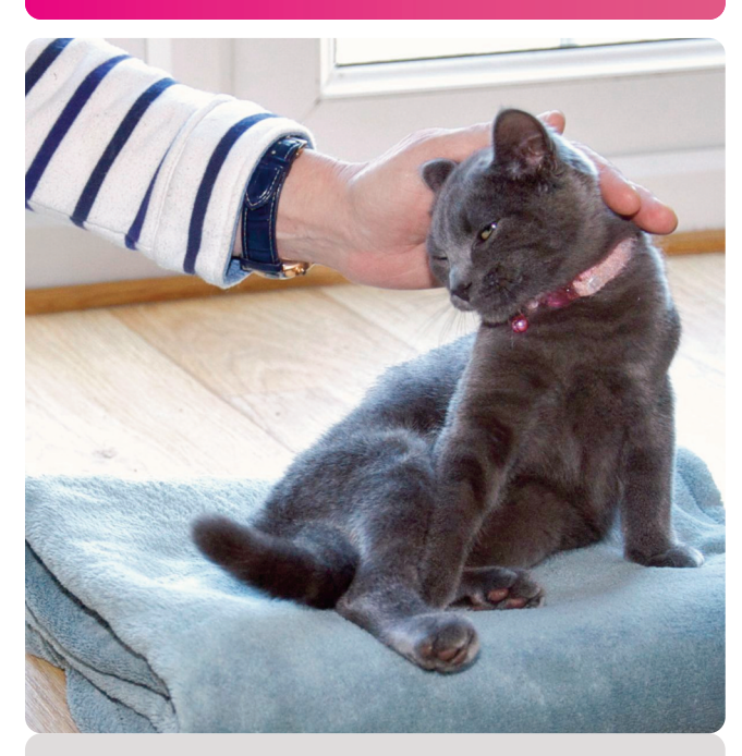
Initial handling should comprise gentle stroking on the head and face area and can be extended to gentle stroking down the back.