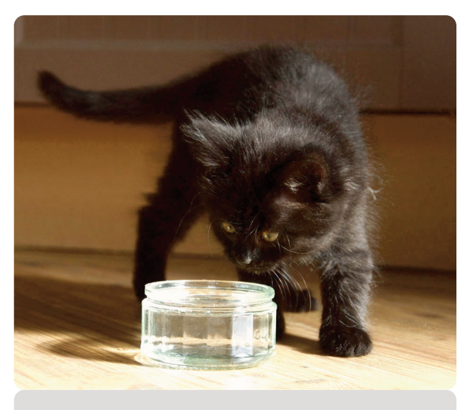
Provide a water source away from food.

Fresh clean drinking water should be available at all times. Water should be placed away from food bowls (avoid 'double bowls' that have food in one side and water in the other), with at least one other alternative water source in another location. Once the kitten has explored the whole house, this could be on another floor of the home.