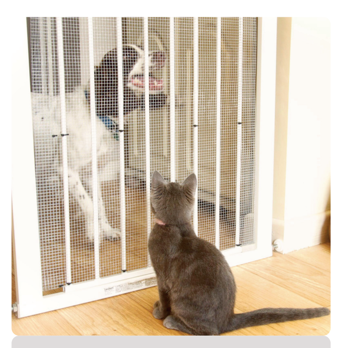
Child safety gates can be used to separate dogs and cats and allow the kitten access to its resources without having to pass the dog.