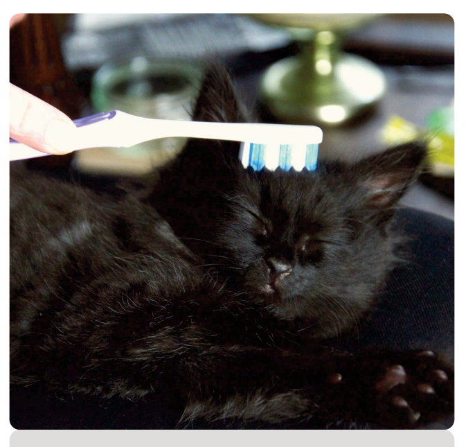
Use a soft toothbrush at first to allow the kitten to feel comfortable with grooming.