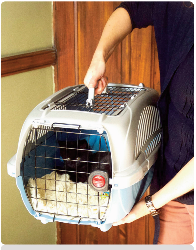
How to carry and support a cat carrier.